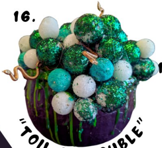
"TOIL & TROUBLE"

16. _____ Where is this pumkin bubbling up?