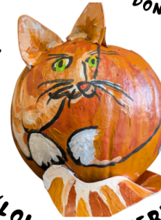
"LOLA O' LANTERN"