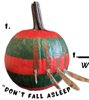
"DON'T FALL ASLEEP"