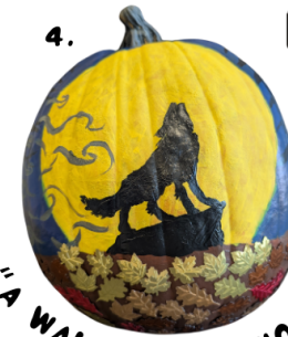
"A WALK IN THE WOODS"

4. _____ Where did you find this woodsy pumpkin?